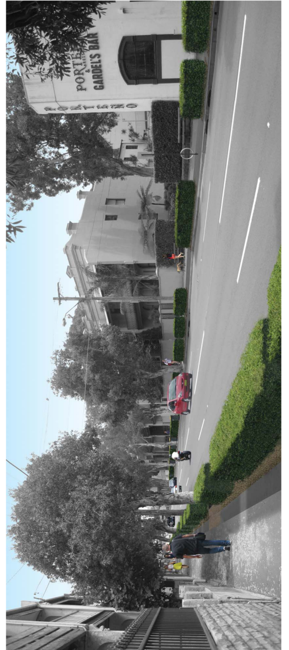
Perspective looking north west towards Wilton/Walker Street